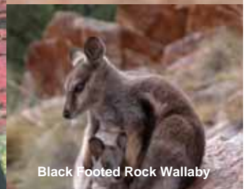
Black Footed Rock Wallaby