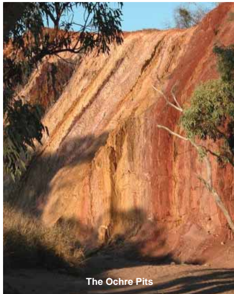
The Ochre Pits