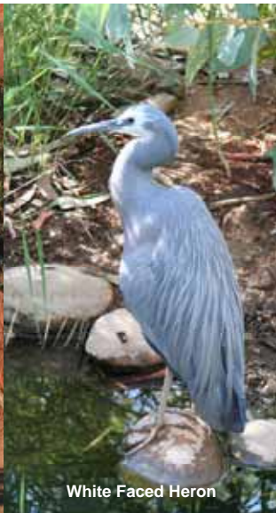
White Faced Heron